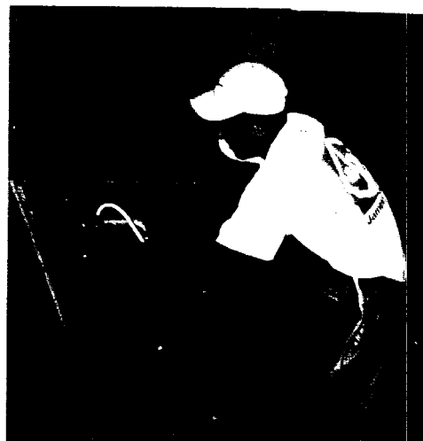
The demolition crew 'strikes the set' of the former science classroom.

We are sincerely grateful to the individuals and groups that took the dream of a science lab and made it a reality.