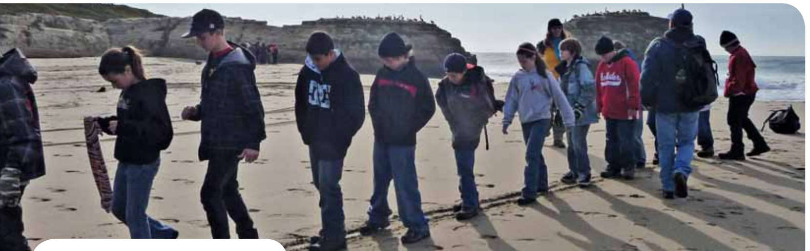
SHPS Sixth graders exploring tide pools at Natural Bridges State Park during Science Camp, 2009

♥ "I think our Junior High staff and curriculum is EXCELLENT and is one of our strongest points. Standards and expectations are high - I'm confident our junior high students will do well in high school and beyond. Don't change anything!!!"