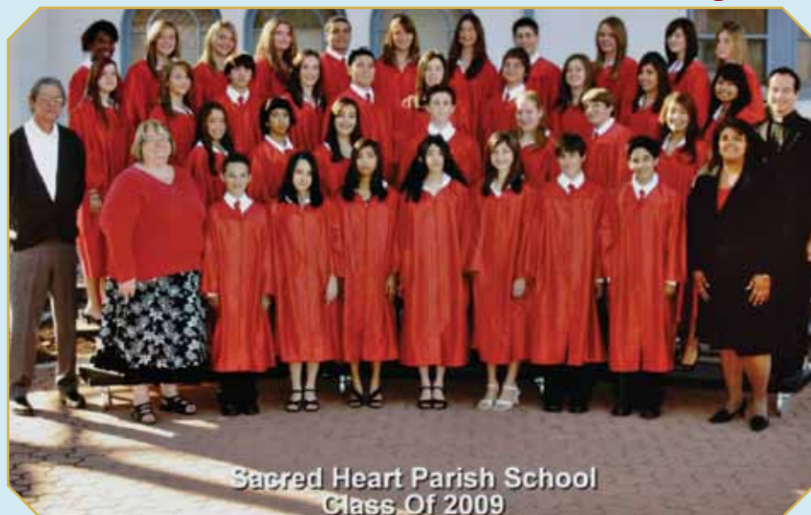
Sacred Heart Parish School Class Of 2009